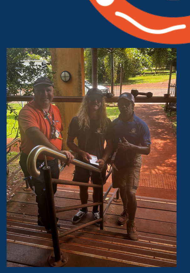
QLeave in Bamaga, Far North Queensland